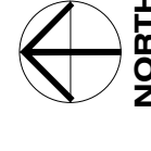
SITE PLAN 3/64" = 1'-0"